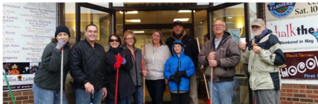
Mount Vernon Clean Up Day, 2016

The mission of the CDG is to develop and promote our business environment, including but not limited to our Main Street District, and enhance the quality of life in the communities we serve.