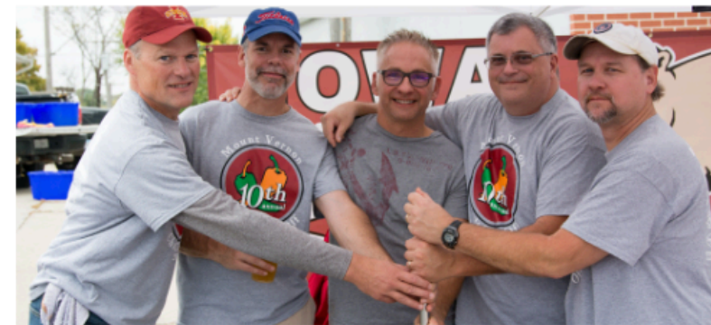
10th Anniversary Chili Cookoff, 2016

Design Committee is involved with the physical aspects of the community including: signage, lighting, streetscapes, historic preservation, and forming a comprehensive look and feel in our downtown district.