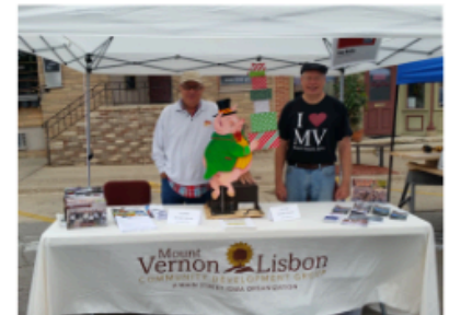
Members of the Animatronics Committee, 2016