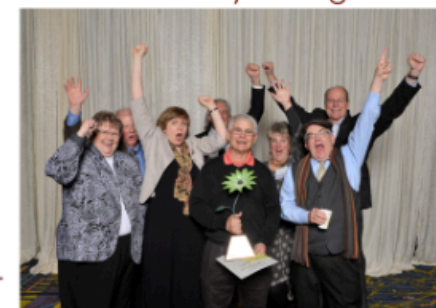
CDG at the MSI Awards in Des Moines accepting the Community Entrepreneurship Award.