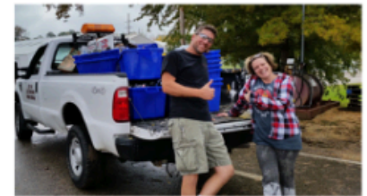
Chili Cookoff Zero-Waste Team, 2016