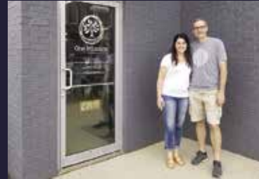
CAUSETEAM (ONE MISSION)