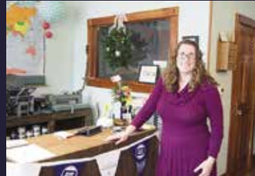
IRON LEAF PRESS