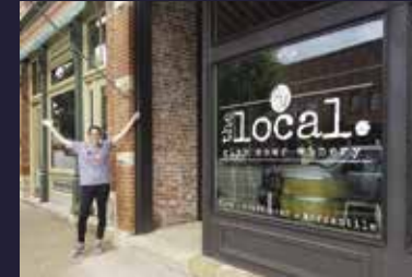
THE LOCAL - GLYN MAWR WINERY