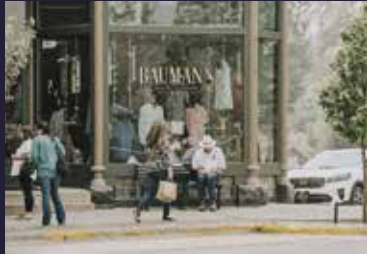
BAUMAN & CO. BESTIE