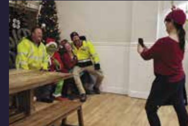
PLANTIFUL PANTRY FRIEND