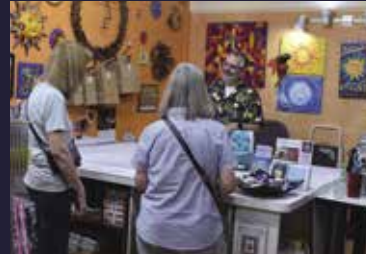
HELIO'S STITCHES N STUFF SUPPORTER