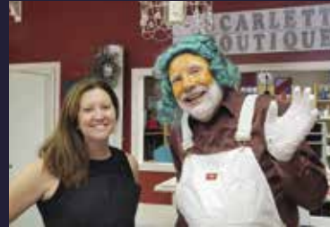
SCARLETT BOUTIQUE SUPPORTER